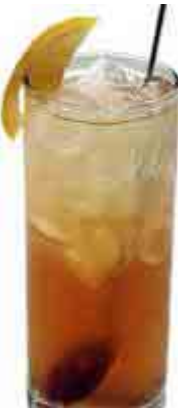
Classic Long Island Ice Tea

Either way North or South, Cola or Maple Syrup this is one of my favorite summer drinks and with all the variations that you can use it can make for an interesting night as you are sitting on the desk or next to the pool.